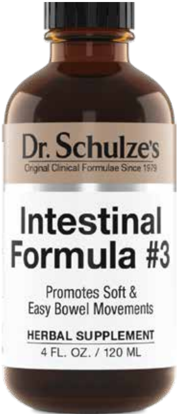
Intestinal Formula #3

A milder, liquid version. For children and adults who need less power to move their bowel.