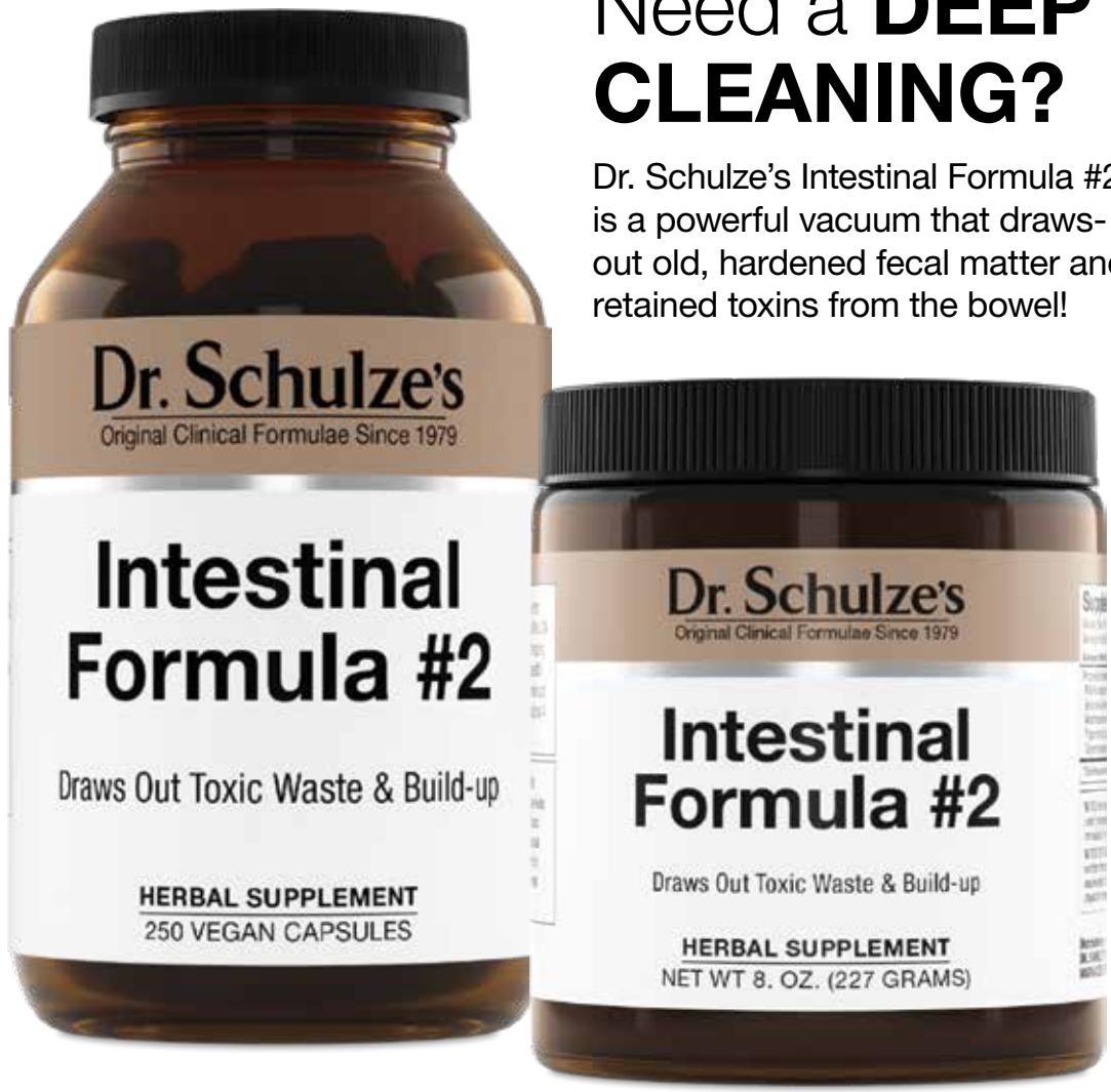
Intestinal Formula #2

Dr. Schulze's Intestinal Formula #2 is a powerful vacuum that draws- out old, hardened fecal matter and retained toxins from the bowel!