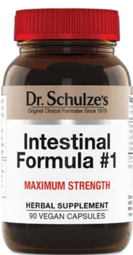
Intestinal Formula #1 MAX

A more powerful version of Intestinal Formula #1